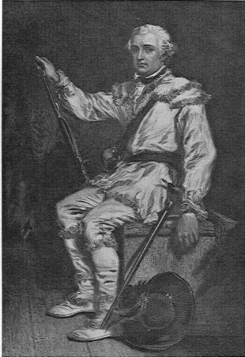
Figure 1: Captain Daniel Morgan organized and led Morgan's Riflemen during the Revolutionary War.